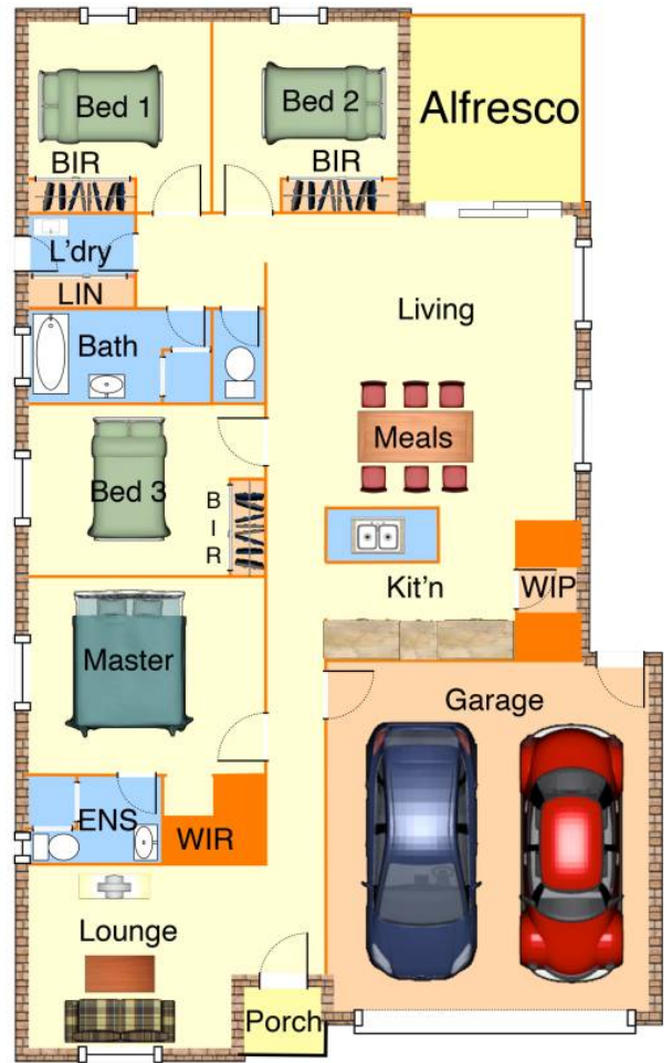
243 Black Forest Road Werribee